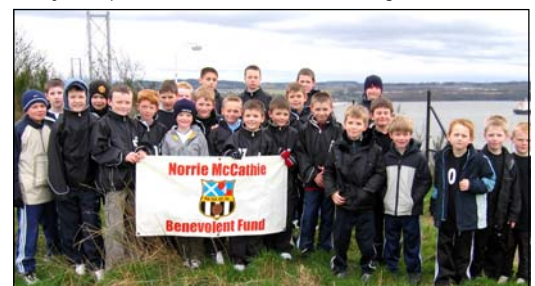
Last years sponsored walk over the Forth Bridge and back

A letter with details of the walk and a sponsor form have been issued to all parents. If you didn't get yours, please contact Janine on janinepennel@btinternet.com or 01383 723540 .